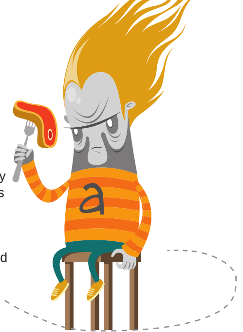
Mary Had a Little Lamb and a Lot of Beef and a Lot of Ham

Imagine a clan of identical triplets, grown up and newly inducted into the glorious ranks of senior citizenry. Triplet A all lifelong has eaten many burgers and fries, and all day long has worked with his hands and on his feet. Triplet B has prepared meals mostly from scratch, and has packed sandwiches to work, where he has sat on his duff under fluorescent lighting talking into cellphones and staring into computers. Triplet C has eaten mostly raw and mostly vegan, and has taught yoga at a health and fitness spa. Who might you wager will live longer?